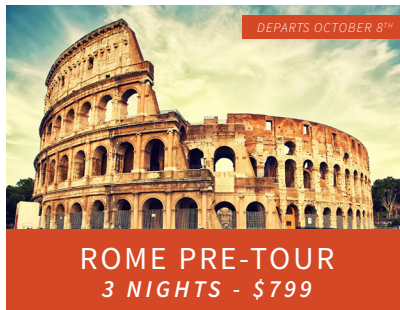
ROME PRE-TOUR 3 NIGHTS - $799

*On some dates tours and cities visited operate in a different order.