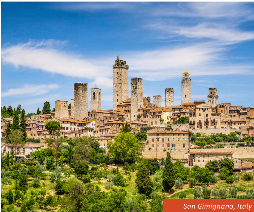
San Gimignano, Italy

wine country of Chianti this afternoon, your stop will include a winery to taste the local superb wine. Enjoy local wines and an educational program as brought to you by the leaders of the local wine industry. This evening enjoy cooking class with home-made pasta making and dinner with wine tasting. (B, D)