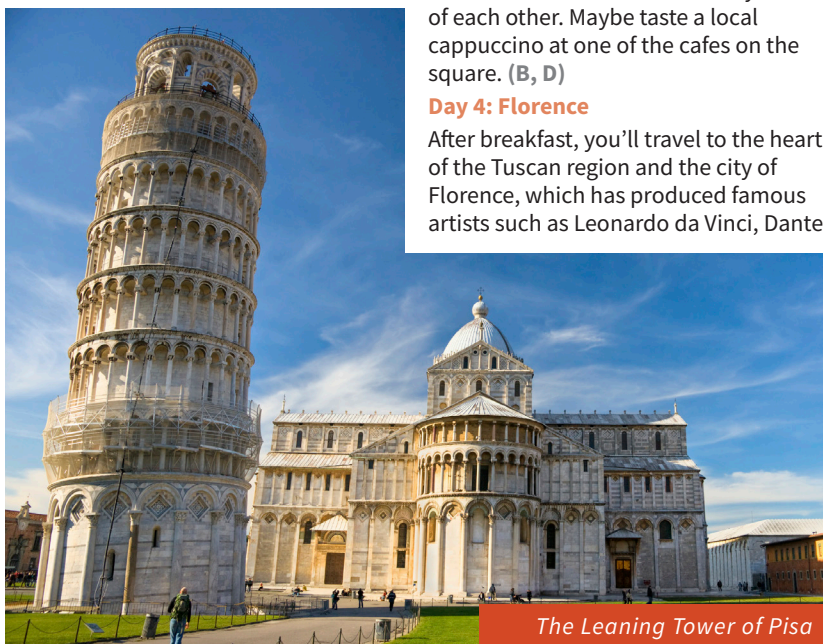
The Leaning Tower of Pisa